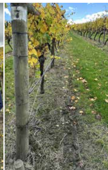
Excellent weed control 9 months after Hellcat and Katana application

Information and data referred to herein were generated using products and rates that were registered at the time, may include extracts from the product label and does not constitute the complete directions for use. Always read and follow product labels. AgNova Technologies Pty Ltd shall not be liable for any consequential or other loss or damage relating to the supply or subsequent handling or use of this product, unless such liability by law cannot be lawfully excluded or limited. All warranties, conditions or rights implied by statute or other law which may be lawfully excluded are so excluded. Where the liability of AgNova Technologies Pty Ltd for breach of any such statutory warranties and conditions cannot be lawfully excluded but may be limited to it re-supplying the product or an equivalent product or the cost of a product or an equivalent product, then the liability of AgNova Technologies Pty Ltd for any breach of such statutory warranty or condition is so limited. © Copyright AgNova Technologies 2024. * Registered trademarks. HELKATTEST240619